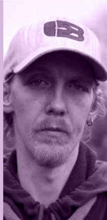
* Indicative image

Sometimes all it takes is a little bit of your time. You could end up talking to somebody, then realise they’re going through the same thing. Then all of a sudden, you realise you’re not alone.”